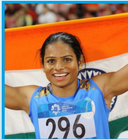
Dutee Chand (Olympic Athlete)

Know your Status to fight against HIV/ AIDS. Get tested and treated.