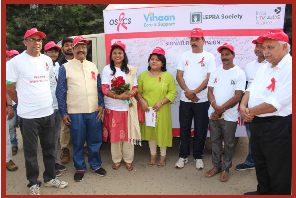
(Signature Campaign conducted to spread awareness slogans and messages)

Following the awareness Rally, A State Wise Conclave was also organized by OSACS at Jaydev, Bhawan, Bhubaneswar. An Exhibition of Paintings crafted by Prison Inmates was also inaugurated.