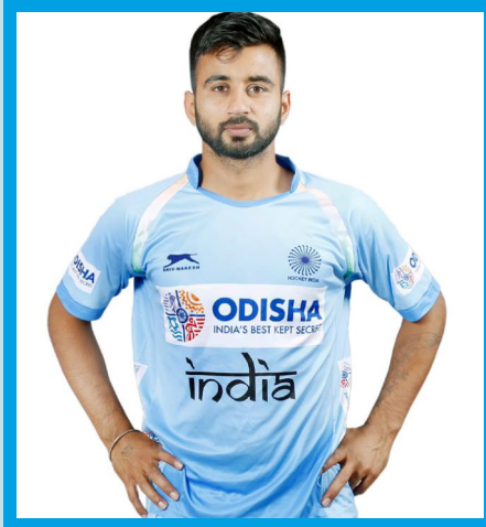
Manpreet Singh (Captain-Hockey India)

Khelo Jeeto Jindagi keliye "Be aware of your HIV Status"