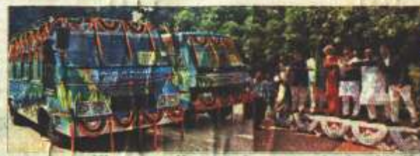
ଏହି ଦିବସ ପାଳନ କରାଯାଇଛି । ଏହାକୁ ପ୍ରୋତ୍ସାହିତ କରିବା ପାଇଁ ଏହି ଦିବସ ପାଳନ କରାଯାଇଛି । ଏହାକୁ ପ୍ରୋତ୍ସାହିତ କରିବା ପାଇଁ ଏହି ଦିବସ ପାଳନ କରାଯାଇଛି ।

ରାଜ୍ୟସ୍ତରୀୟ ଏଚସିବ ଦିବସ ସମାଜସେବୀ ଓ ସାମାଜିକ କର୍ମୀଙ୍କୁ ପ୍ରୋତ୍ସାହିତ କରିବା ପାଇଁ ଏହି ଦିବସ ପାଳନ କରାଯାଇଛି । ଏହାକୁ ପ୍ରୋତ୍ସାହିତ କରିବା ପାଇଁ ଏହି ଦିବସ ପାଳନ କରାଯାଇଛି । ଏହାକୁ ପ୍ରୋତ୍ସାହିତ କରିବା ପାଇଁ ଏହି ଦିବସ ପାଳନ କରାଯାଇଛି ।