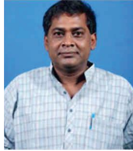
Sj. Naba Kisore Das Hon'ble Minister, Health & F.W. Govt. of Odisha