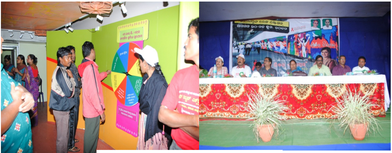
Inaugural Ceremony at Koraput