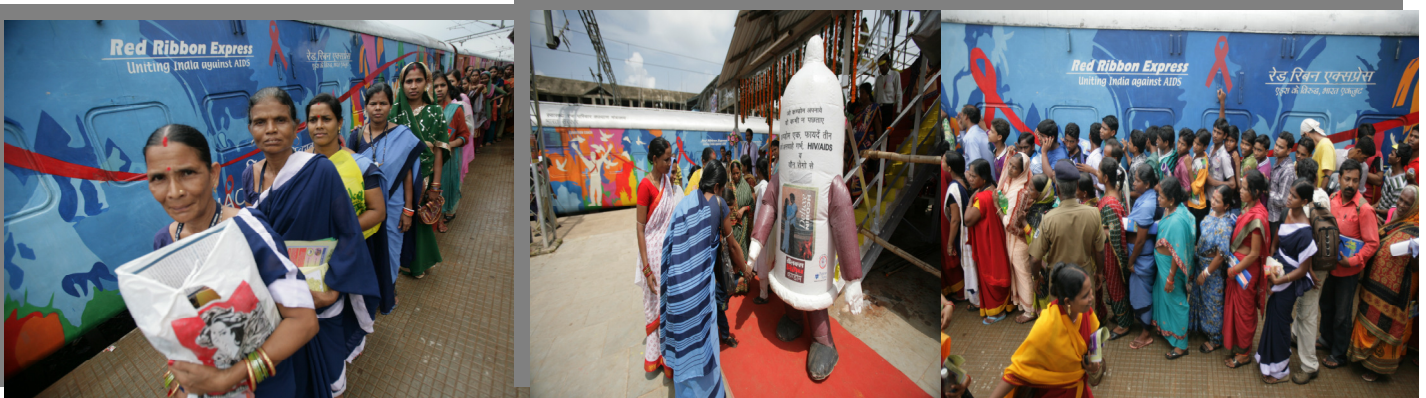
MANCHESWAR RAILWAY STATION