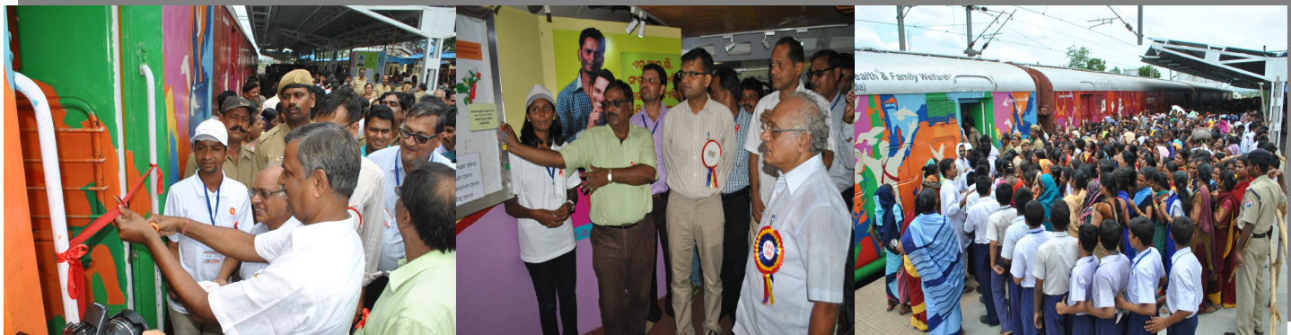
BERHAMPUR RAILWAY STATION