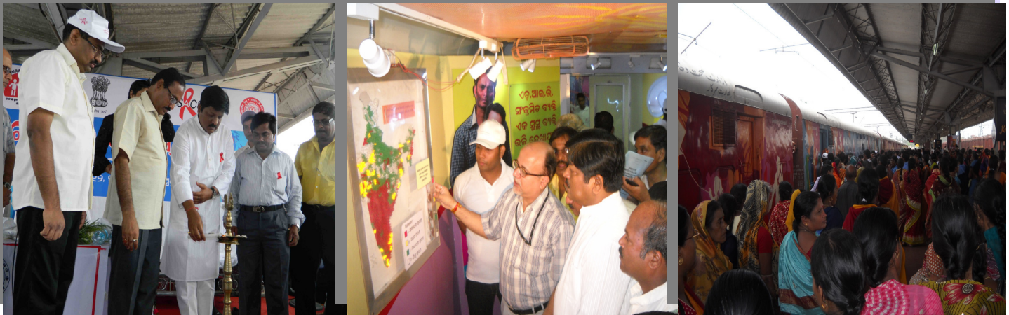
ANGUL & CUTTACK RAILWAY STATION